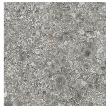
Cemento VC6003 ■ T095