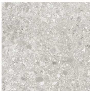
Gris VC6002 ■ T095